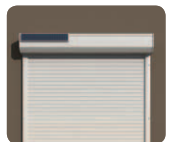
Solar Panel to Pelmet*