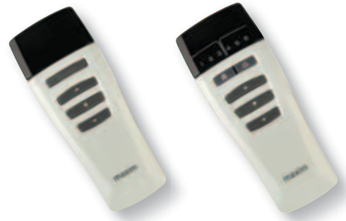
1 Channel Transmitter

The SolarSmart™ system incorporates the stylish CW Maxim Radio Transmitter and is available in both 1 Channel and 6 Channel options. Both transmitters are powered by a 3 Volt Lithium button battery.