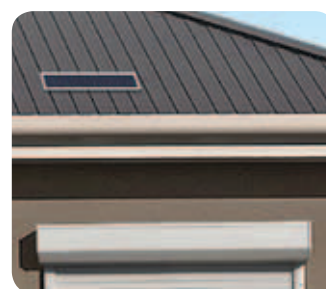
Roof Mounted Solar Panel

The SolarSmart™ Battery Pack may require future maintenance and/or replacement. This should be considered in difficult to reach applications like on the second storey of a building.