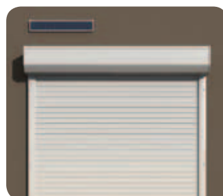
Solar Panel to Wall*